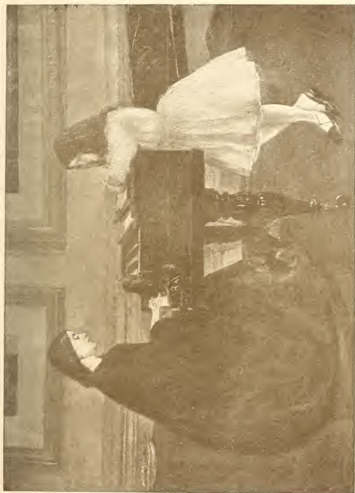
"AT THE PIANO."